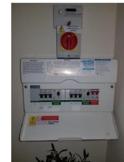
Example 1. Fuse board and isolation switch

Every home has one and it is where all your domestic electrical supplies are powered from.