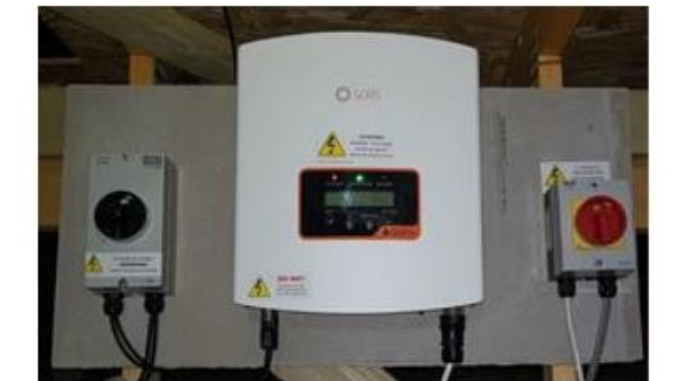
Example 2. - Inverter and isolation switches in loft space